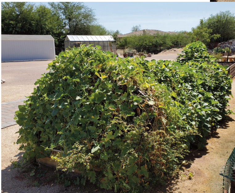
Results from an Improper Garden Preparation